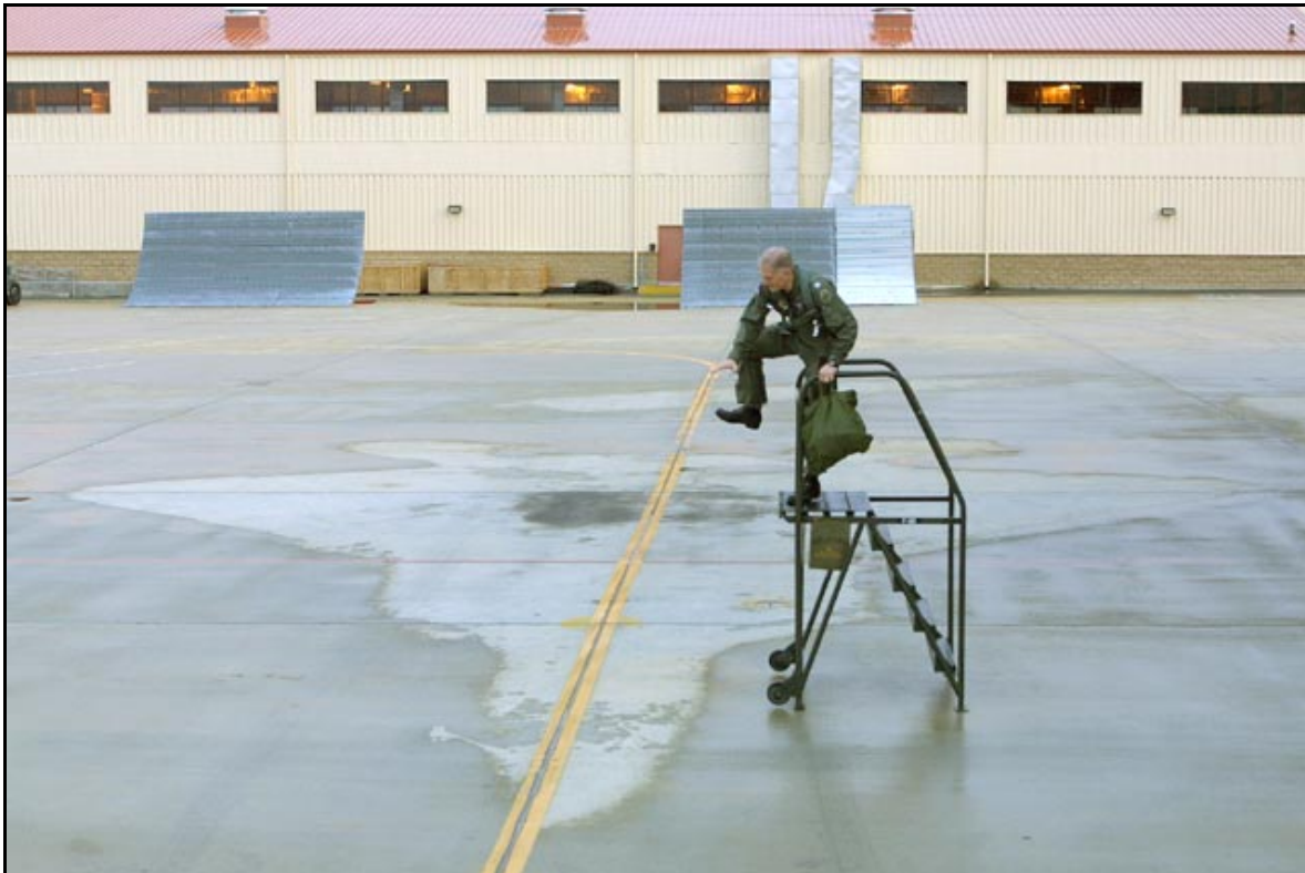
Lockheed-Martin's Latest Stealth Aircraft Submitted by Tom Myers