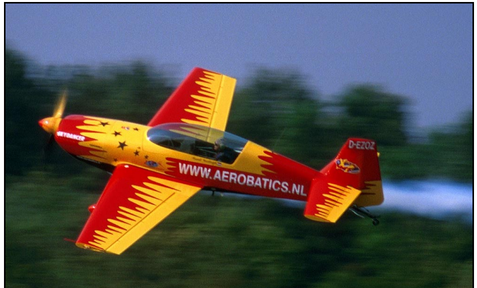
Extra 300L after takeoff