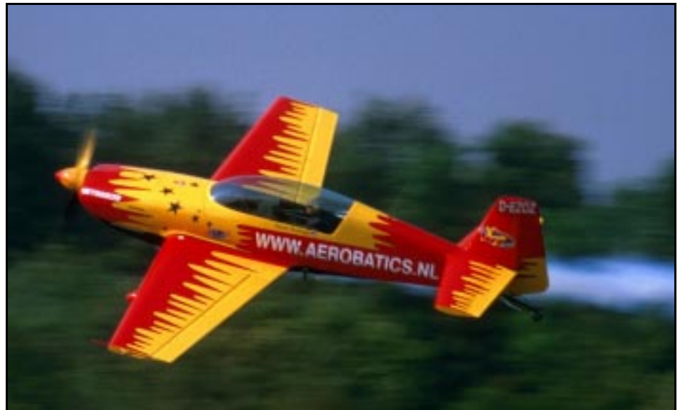
Extra 300L after takeoff