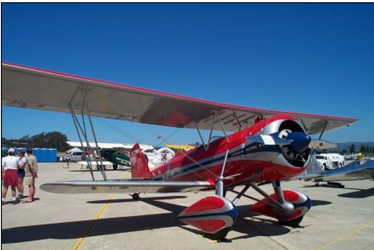
A Stearman Model 4E at the Watsonville Fly-in & Airshow