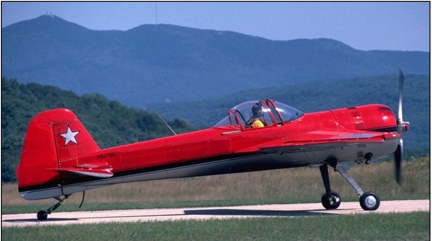
Yak-55 Taxiing for takeoff