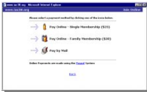
Select your payment option (Step 3)

3D\ 2QOLQH 6LQJH OHPEHUVKLS, 3D\ 2QOLQH )DPLQ OHPEHUVKLS, RU 3D\ E\ ODLO (, H[SODLQ WKH 3D\ E\ ODLO RSWLRQ EHORZ). 2QFH \RX VHOHFW DO RSWLRQ, \RX ZLOO EH WDNHQ WR WKH 3D\3DO VHFUXH SD\PHQW SDJH.