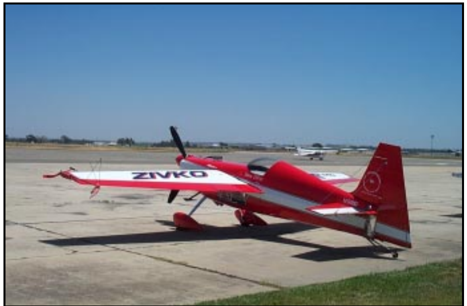
Photo: Zivko Edge 540 owned by Chapter 38 member Norm DeWitt. Photo from Paso 2000.

For more info visit: http://www.zivko.com