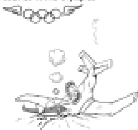
Aerobatics in the Olympics

Wow! What a performance! And he really stuck the landing!